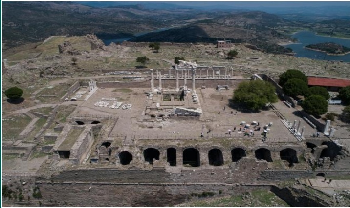
THE ANCIENT CITY OF BERGAMA