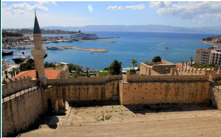
THE CASTLE OF CESME